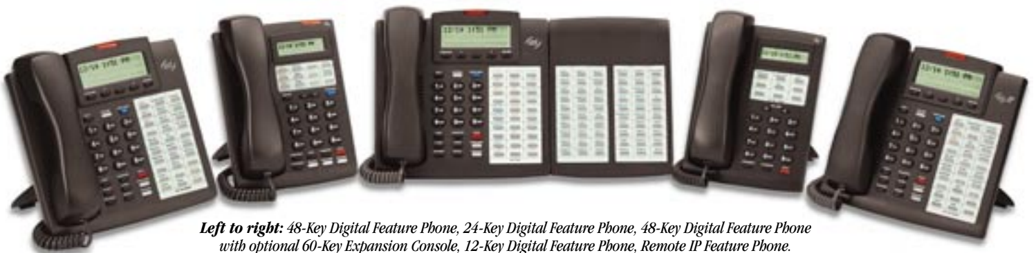
Left to right: 48-Key Digital Feature Phone, 24-Key Digital Feature Phone, 48-Key Digital Feature Phone with optional 60-Key Expansion Console, 12-Key Digital Feature Phone, Remote IP Feature Phone.

ESI's built-in automatic call distributor (ACD) — another standard X-Class feature — manages incoming departmental calls. You can easily program handling and distribution of calls (including those waiting in queue), and monitor how efficiently your inbound calls are being managed. Incidentally: ACD is for businesses of all sizes, because even just one extension can benefit from its advantages. If you're in business and you take phone calls, ACD will improve your communications with your customers and prospects.